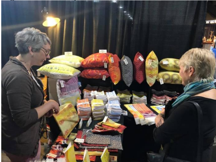
Figure 3: Kentucky Arts Council: How We See Ourselves

KAC submitted Figure 4 to represent a small, isolated, rural arts organization in Appalachia. While the Star Theatre perceived themselves to be integral to their community, the KAC did not immediately think of an organization such as a community theatre to represent the arts in the region. KAC perceived rural arts in Appalachia to be folk art, in this specific photograph, dulcimer making. There is incongruity in these photographs between how both organizations perceive themselves and one another.