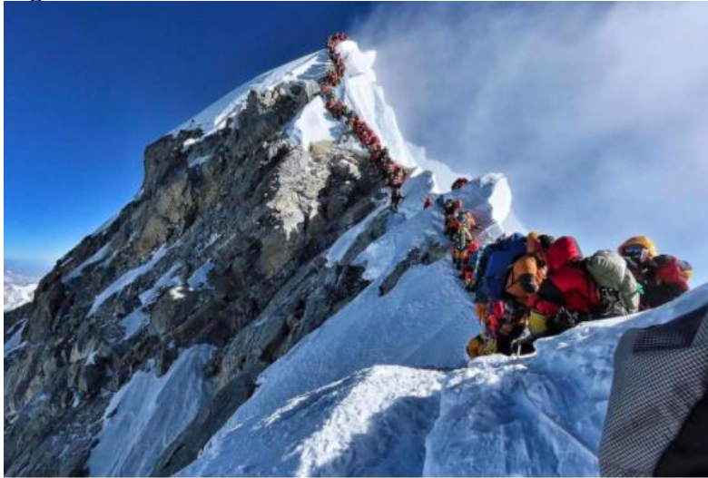
Figure 5: How GNT Perceives the Tennessee Arts Commission

The Everest image and the verbal reflections it evoked exemplified the complete contradiction between GNT and TAC with more clarity and strength than any of the words they spoke regarding one another.