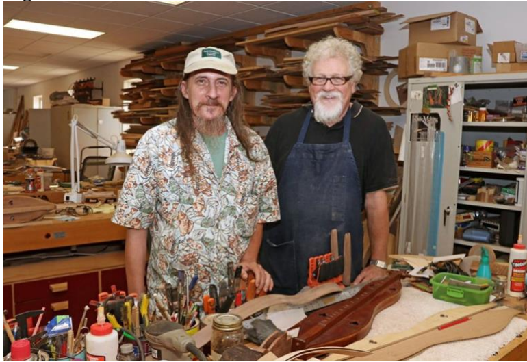
Figure 4: How KAC Perceives SIRAOs.

The value of the photograph submissions and the discord they make evident between those two participants was great. In verbal interviews, participants used polite words and occasionally evaded answers they thought might be considered negative. For example, “So, yeah. So a lot of, um... So I'd never like to do it [talk to KAC] again” (Star, 2.2). That quote was from an interview with the Star Theatre. In contrast, their images communicated their emotions (pride and affection for their own organization and frustration with KAC). In their lack of verbal response, it would have been inappropriate for me to try to draw too much emotional conclusion from their sometimes-vague answers. The images filled in any gaps that might have previously existed based on their verbal-only responses. Beyond the images only, the verbal answers the images evoked from participants was also much more detailed and elaborate than the answers they provided in solely verbal response to my questions.